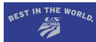
General design back print

or choose: ● your favorite sport specific pack which includes your choice of one of the following designs printed on a high quality 100% cotton white t-shirt with the 2005 lapel pin and U.S. Ski Team shield decals.