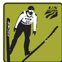
JUMPING NORDIC COMBINED

The sport is designated on the front of the shirt. "Best in the World" and U.S. Ski Team shield on the back