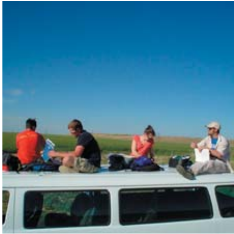
Colorado Plains Watercolor Trip