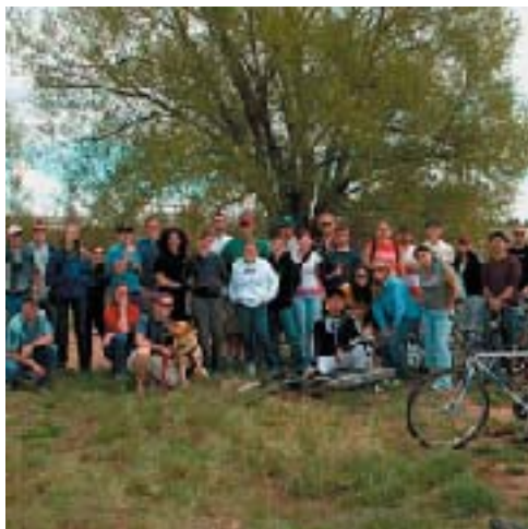
Class of 2008